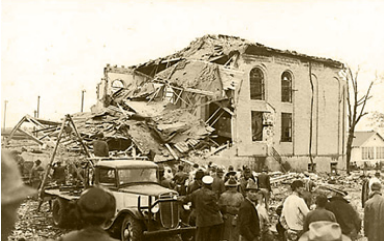
The New London, Texas School on March 18, 1937.