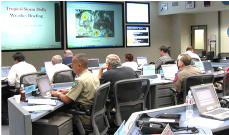
Members of the Emergency Management Council at their stations during Tropical Storm Dolly.