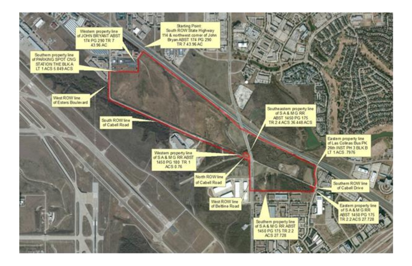
Exhibit A PID Boundary Map