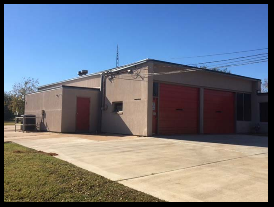
Retired Fire Station # 5