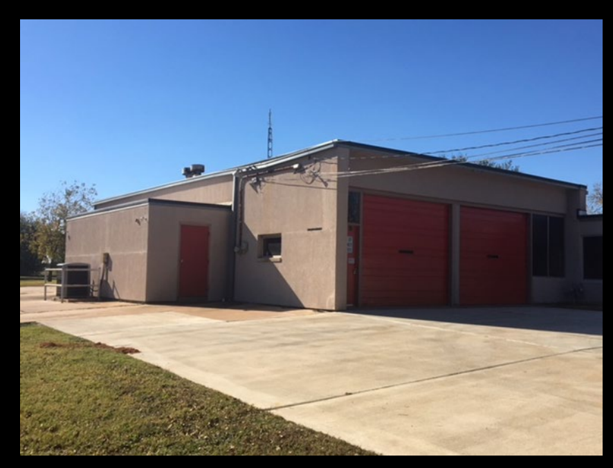
Retired Fire Station # 5