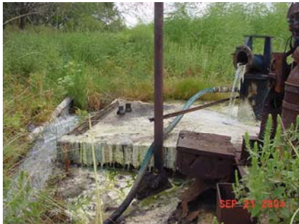
Day & McDaniel's wells – September 2004 (from EAA files)